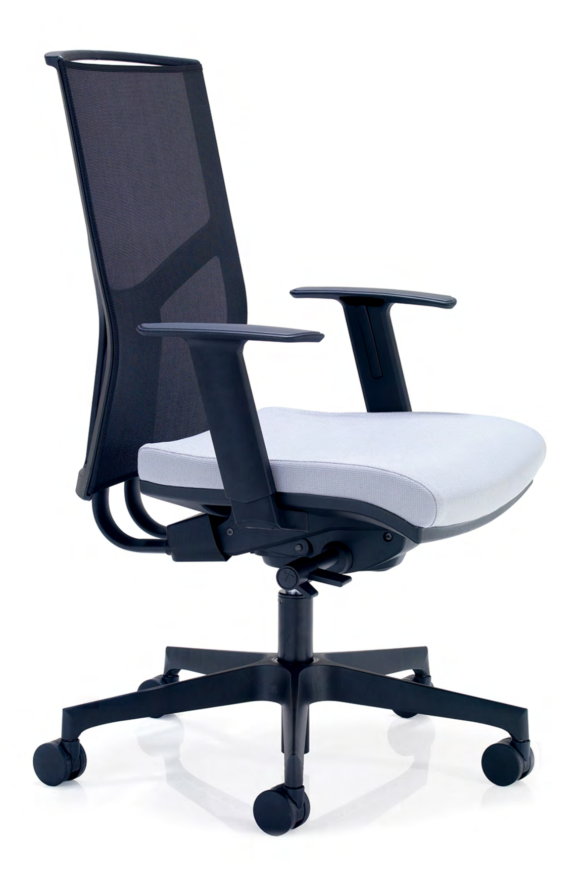
Aeon Mesh Prices start from £260 +VAT Other finishes available