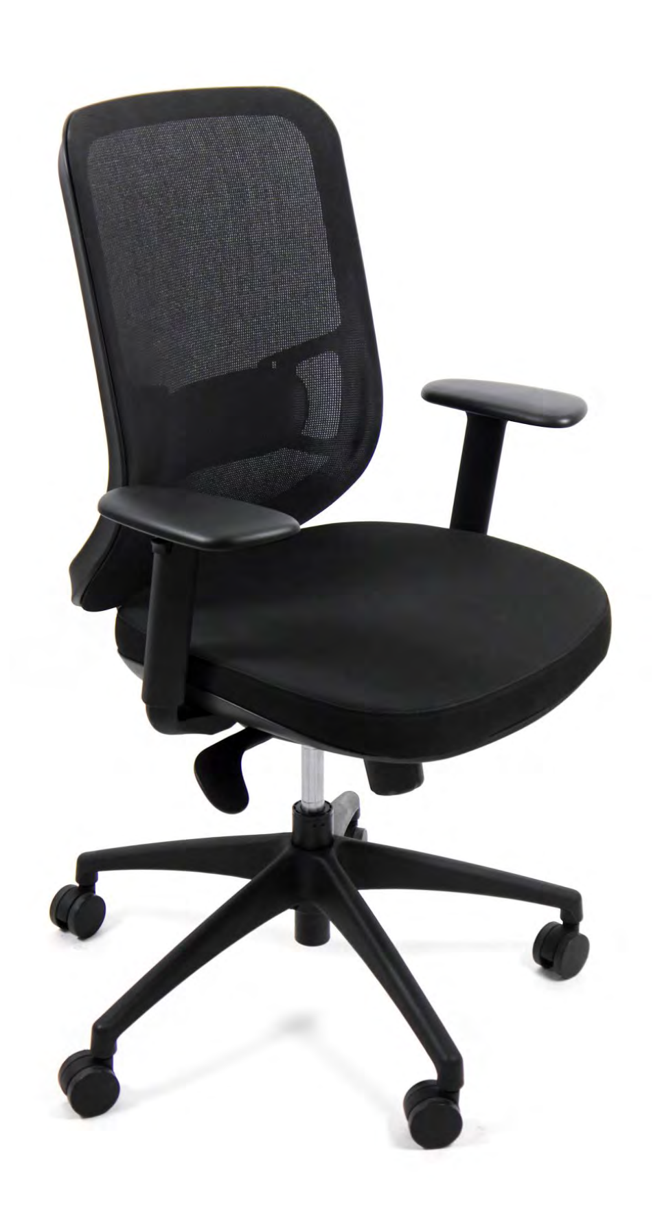
Arran Prices start from £215 +VAT Other finishes available