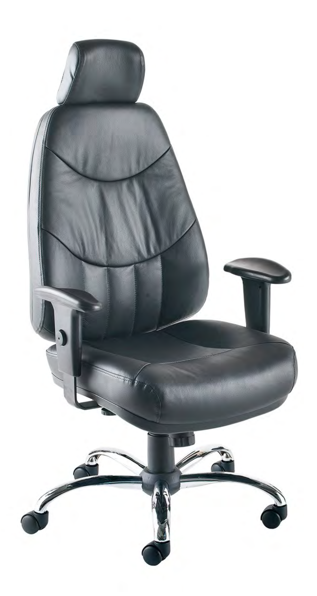
Mercury Executive Prices start from £485 +VAT