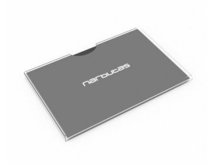
Plexiglas name card holder