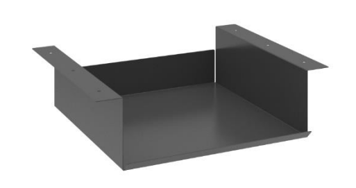
Metal shelf (central) for doors with mail slot

Customize your locker by using additional items.