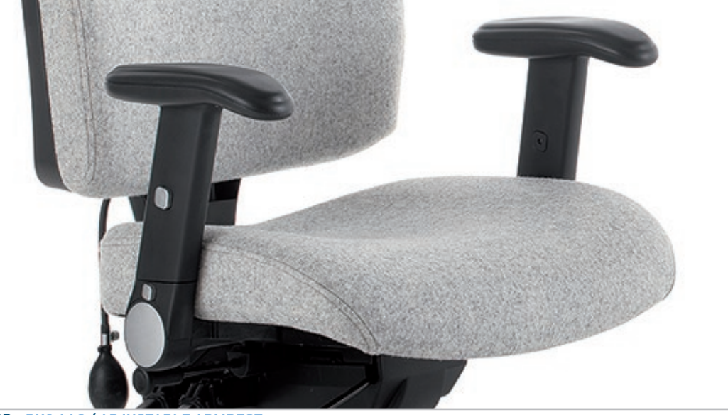
PP - PH2 AAG / ADJUSTABLE ARMREST